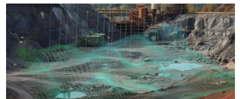
MINING AND CONSTRUCTION